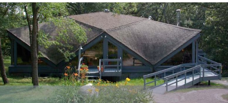
One of the unique classroom buildings at our beautiful Wisconsin campus.

The community of WGU students, faculty, and staff gather monthly for a weekend residential session on its campus at the Prairie Springs Woods Conference and Retreat Center near Elkhorn, Wisconsin. The address is N7698 County Highway H, Elkhorn, WI, 53121.