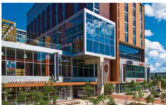
Aveda Institute Madison

Classrooms of all sizes have been designed to provide the proper environment for different types of learning and activities. The classrooms are equipped with the latest technologies in audio-visual equipment including; televisions, DVD players, internet connection and an on-site video drive.