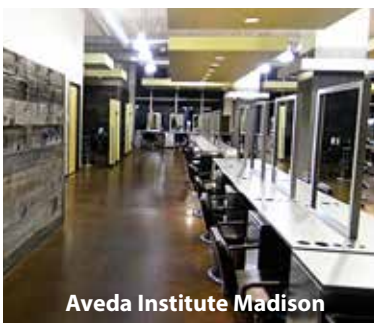
Aveda Institute Madison