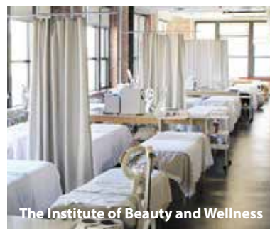
The Institute of Beauty and Wellness