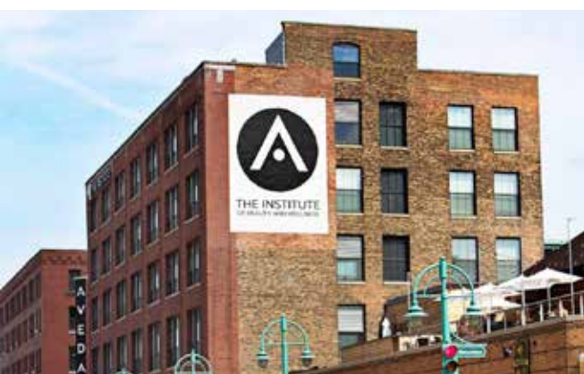
The Institute of Beauty and Wellness