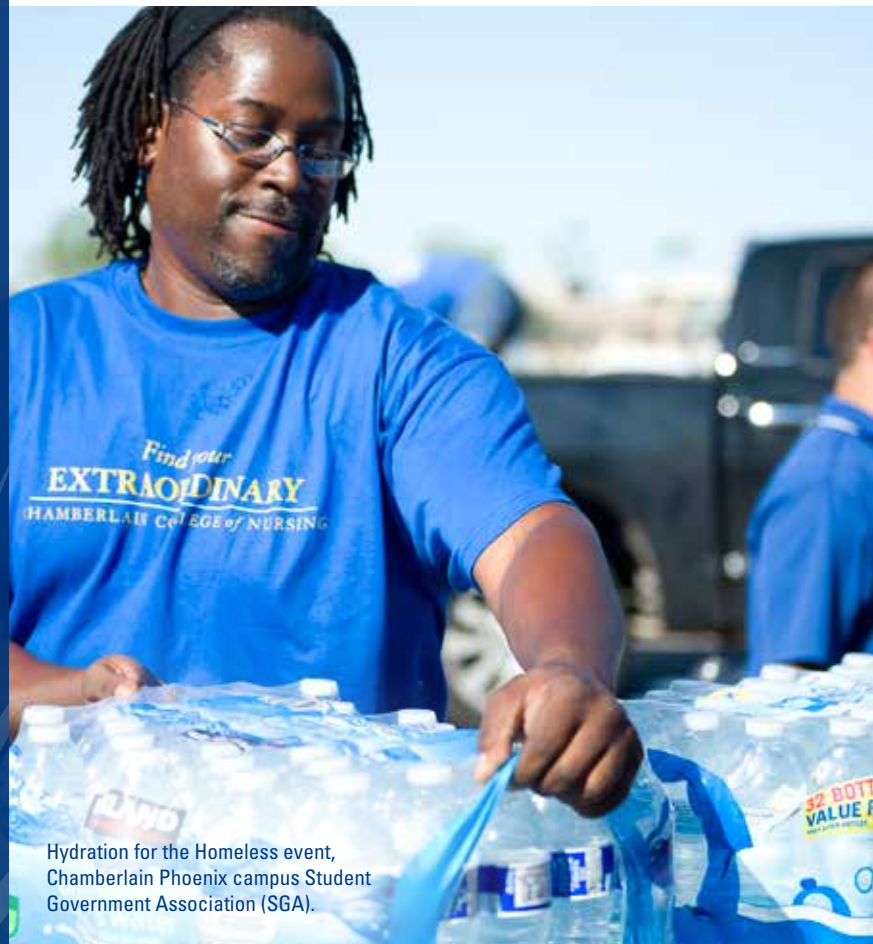
Hydration for the Homeless event, Chamberlain Phoenix campus Student Government Association (SGA).