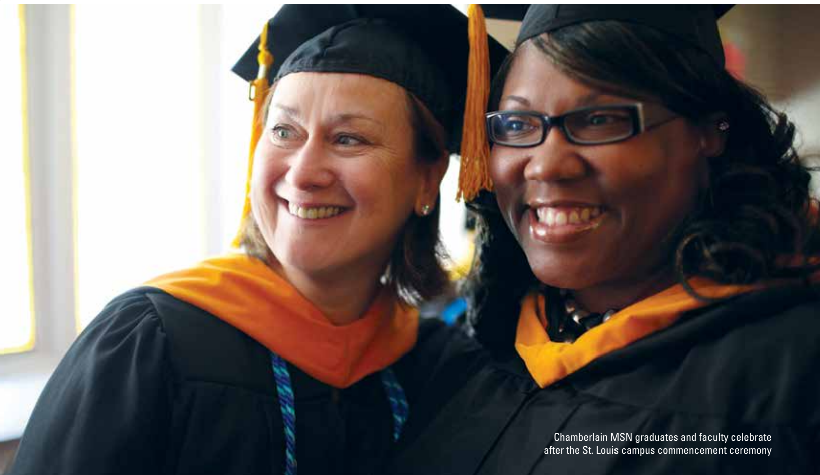
Chamberlain MSN graduates and faculty celebrate after the St. Louis campus commencement ceremony