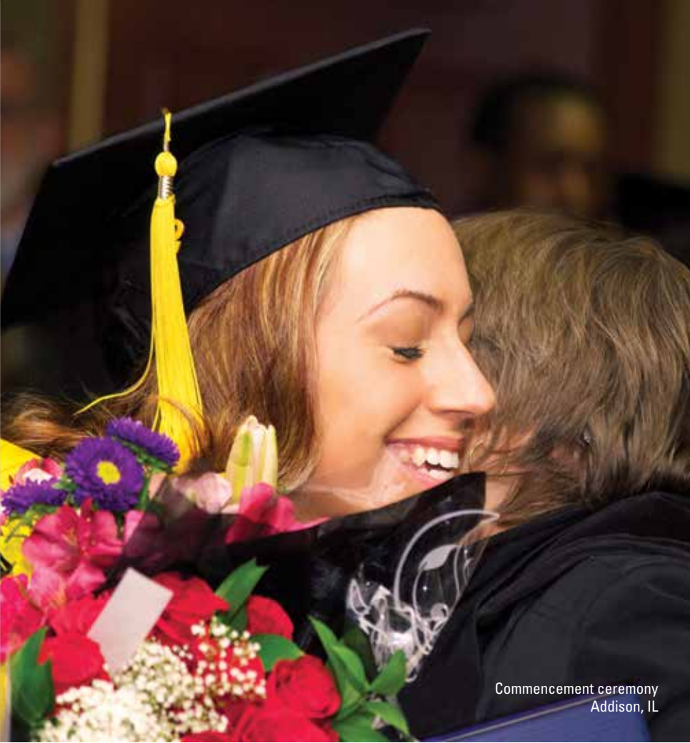
Commencement ceremony Addison, IL