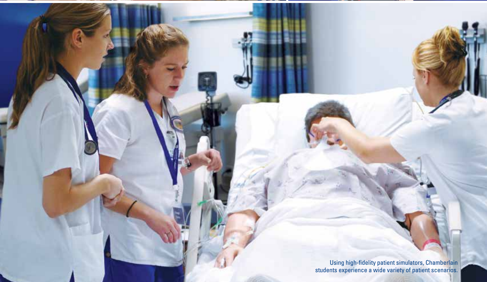
Using high-fidelity patient simulators, Chamberlain students experience a wide variety of patient scenarios.