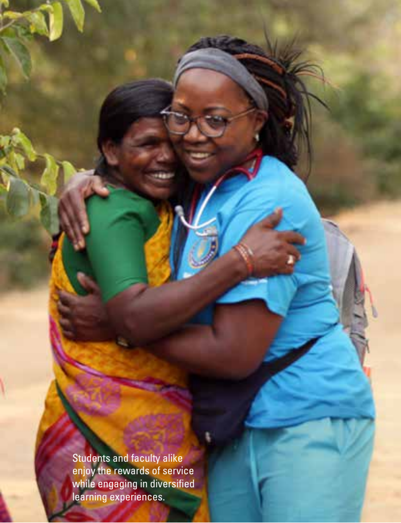
Students and faculty alike enjoy the rewards of service while engaging in diversified learning experiences.