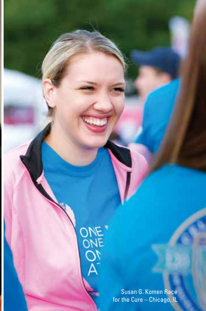
Susan G. Komen Race for the Cure – Chicago, IL