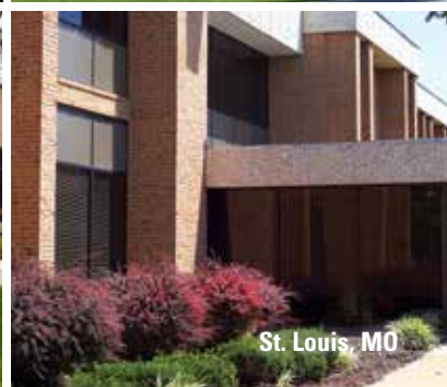
St. Louis, MO