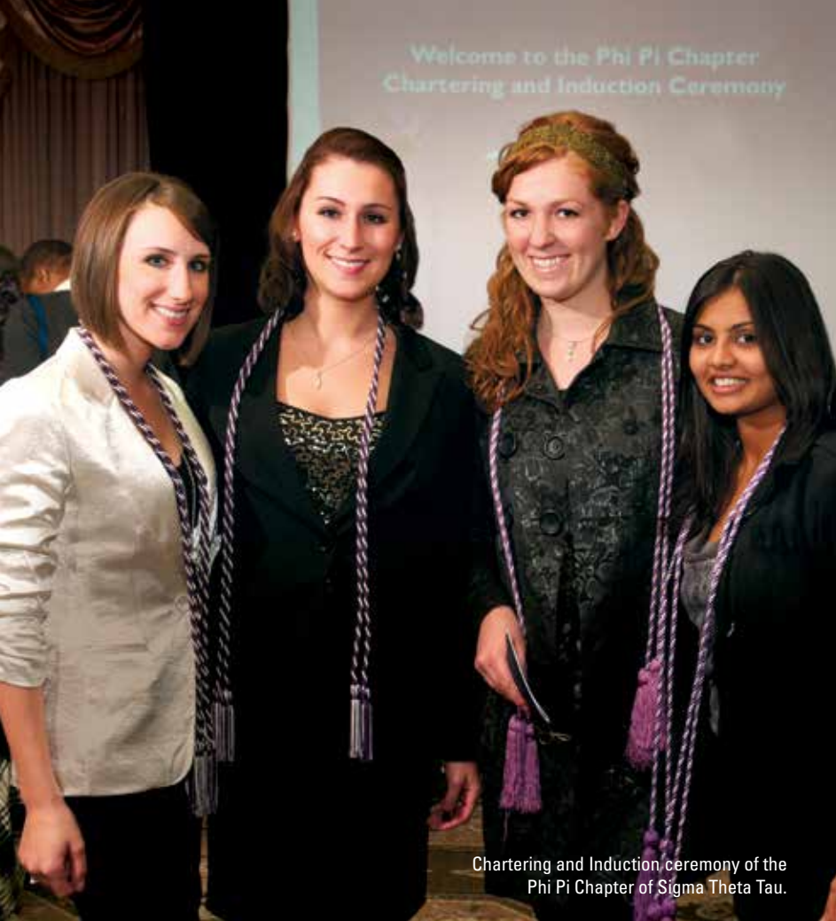
Chartering and Induction ceremony of the Phi Pi Chapter of Sigma Theta Tau.