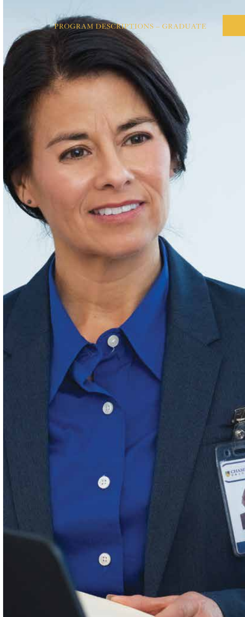
Successful completion of Chamberlain's MSN FNP specialty track and

NOTE: In order to meet the standards of the Minnesota Higher Education Board, Chamberlain is implementing the following policy. Chamberlain will support all Minnesota residents enrolled in post-licensure and graduate programs to ensure that sites are available for clinical, practicum, and fieldwork experiences within a 50-mile radius of their home address. Student may elect to choose a practicum site beyond a 50-mile radius of their home address. Students will notify the Chamberlain practicum coordinator of the preferred site(s) and potential preceptor, if identified, no later than four (4) months prior to enrolling in the clinical, fieldwork or practicum experience. Chamberlain representatives will work with students and sites to explore the feasibility of clinical/practicum/fieldwork experiences. When a site is willing to host a student, the practicum coordinator will determine the site required documents and agreements, and confirm the availability of the site on the student's behalf. The student must ensure that the clinical/practicum/fieldwork preceptor completes all documentation required for the experience.