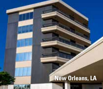
New Orleans, LA