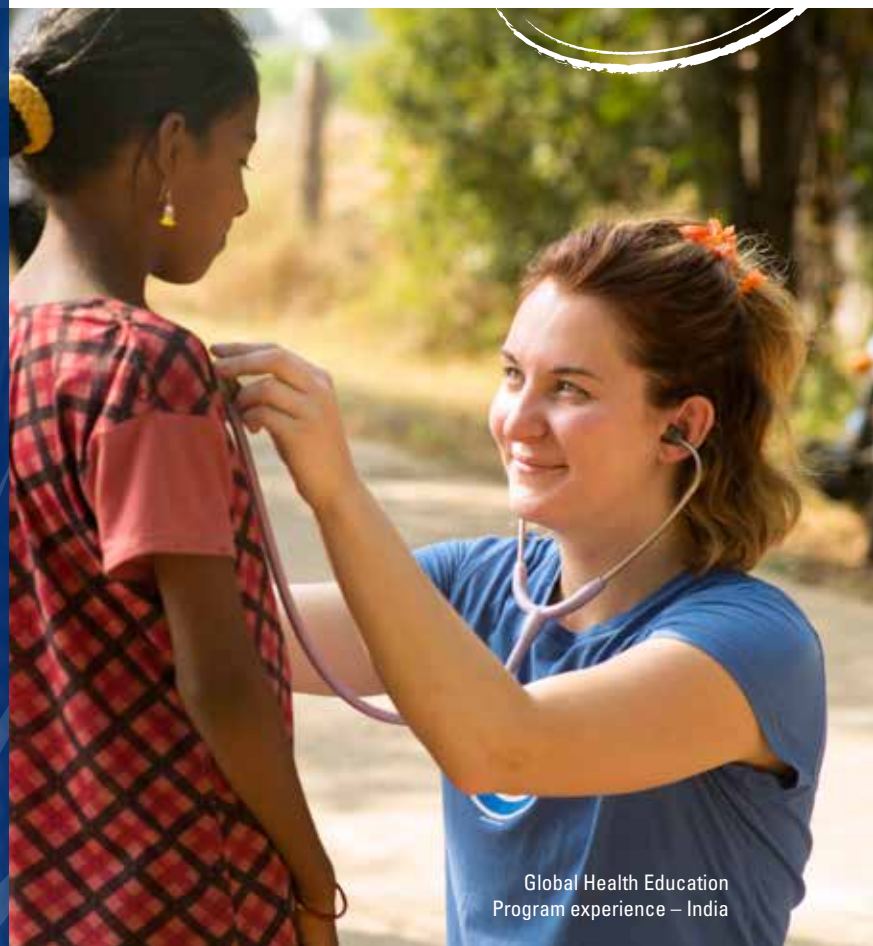
Global Health Education Program experience – India