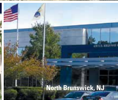
North Brunswick, NJ