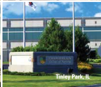
Tinley Park, IL